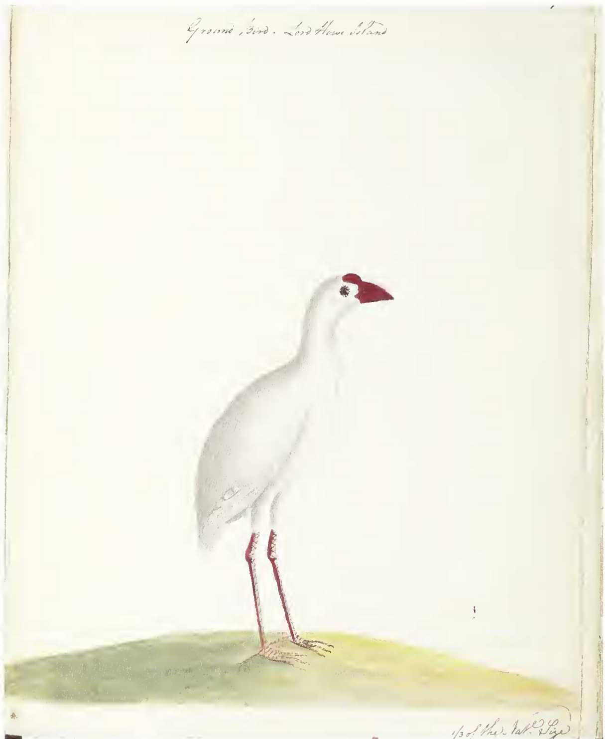
Figure 3. Ground Bird of Lord Howe Island; a Lord Howe Gallinule Porphyrio albus depicted by John Hunter (1788–90) (National Library of Australia, Canberra)